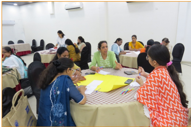
Participants engaged in group exercise.

On the second day of the training programme, a group exercise was conducted in which the participants were divided into seven groups and asked to make action plans on 'strategic interventions for promoting women & child sensitive governance'.