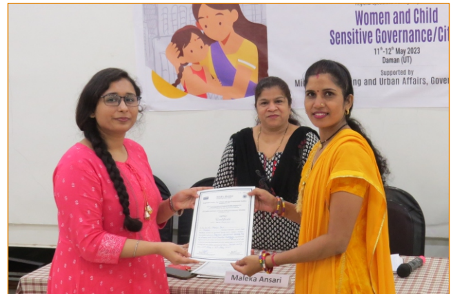
Distribution of Certificates among participants at Daman.