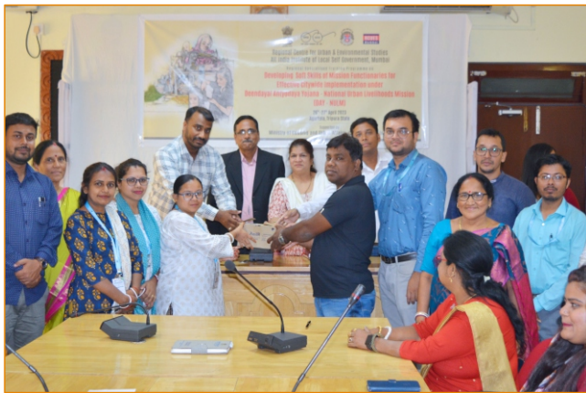
Participants felicitated for best group work and presentation.

Participants were divided into eight groups. Each group discussed their ideas and developed a plan for implementing DAY-NULM by developing soft skills among the mission functionaries with key action points towards achieving convergence with SBM-U 2.0. At the end, each group presented their action plan on establishing linkages and convergence with SBM-U 2.0. The best group was awarded a token of appreciation for best plan preparation and presentation amongst the eight groups.