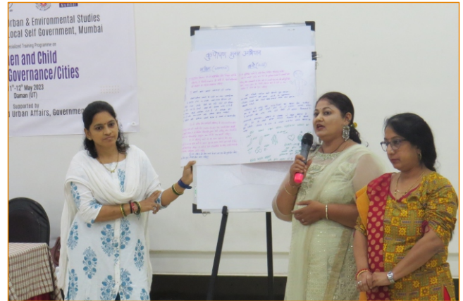
Presentation of group exercise by participants.

The participants were asked to discuss among themselves key actions that they will undertake in their respective cities to ensure promoting women and child sensitive governance. Along with this, they were asked to discuss key initiatives that they will undertake to implement at ULB level. This was followed by a presentation on key points framed by each group. A token of appreciation was given to the preparation and presentation of the best action plan.