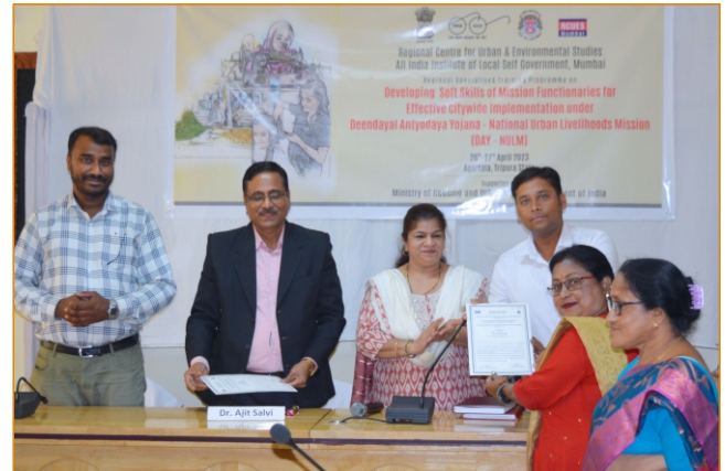
Distribution of Certificates among participants at Agartala.