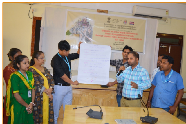
Presentation of group exercise by participants.

The group exercise was conducted to motivate the participants to prepare an action plan to implement DAY-NULM by establishing linkages and convergence with SBM-U 2.0 in their respective cities.