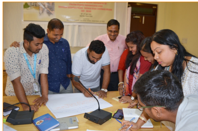
Participants engaged in group exercise.

The group exercise was conducted to motivate the participants to prepare an action plan to implement DAY-NULM by establishing linkages and convergence with SBM-U 2.0 in their respective cities.